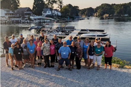
August meeting at Upper Deck